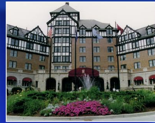
The Hotel Roanoke & Conference Center Roanoke, Virginia

Non-Profit Org. U.S. POSTAGE PAID Blacksburg, VA 24060 Permit No. 28